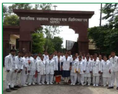
Nursing student gets training by Institute of Mental Health and Hospital, Agra

All the related books are available (Nursing Books) in nursing library, the spacious library of the college with the collection of above 4000 books and many Cds. Total Area of Library is 2900 Sq.ft.. There are several copies of text books. A many Journals (National & international) News papers, Magazines are subscribed. Qualified and experienced library staff help them in making use of these facilities. In the Library Computer system are available with cyber facilities with free Wi-Fi. There are separate room for Graduate & Diplomatic student. Impact positively on the academic achievement of the students. Students can perform better during examination by reading various books