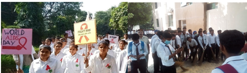
Students organizing a rally in honor of World AIDS Day

Skillfully train our learners to establish Yoga Therapy centers or work in spa, wellness centers and hospitals.