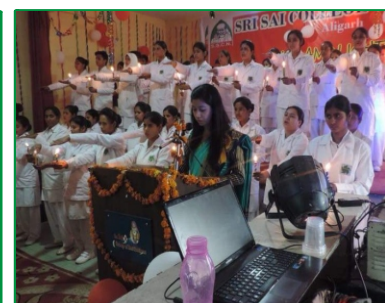
Oath taking Ceremony by Nursing Students