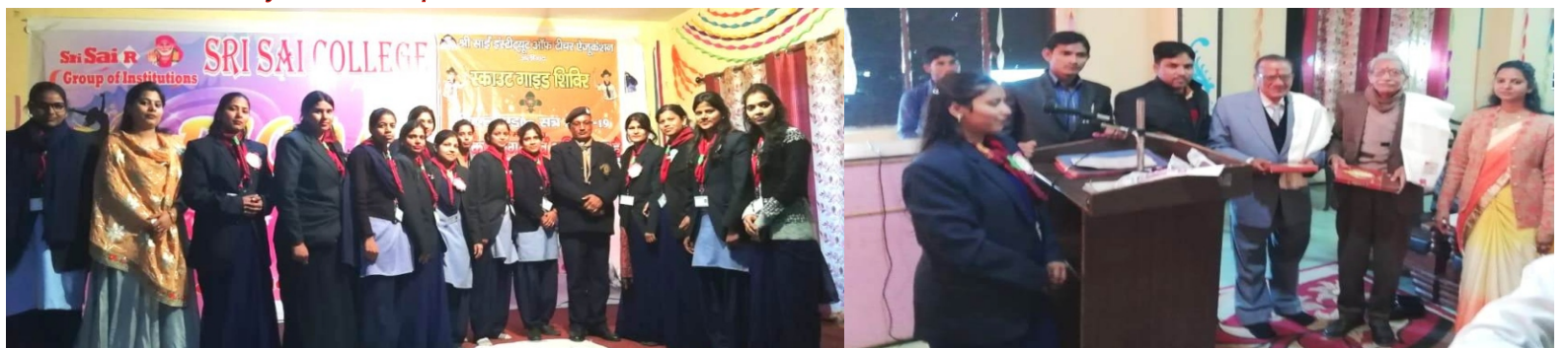
Scout Guide Programme

Lab:- Hi-tech. well equipped laboratory is available in college by experience technician. Lab facilities are available for routine examination of healthy & diseased persons.