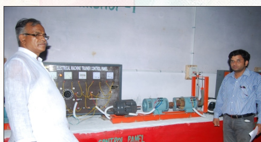
Reflecting Institute Electrician laboratories during SCVT inspection