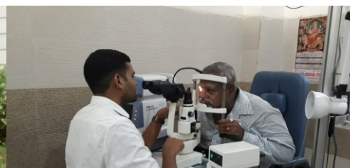
Investigating the patient's eye in optometry department