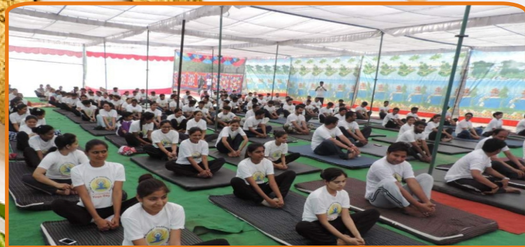
Celebration on "YOGA DAY"