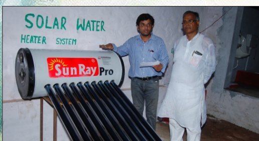
Reflecting Institute fitter laboratories during SCVT inspection