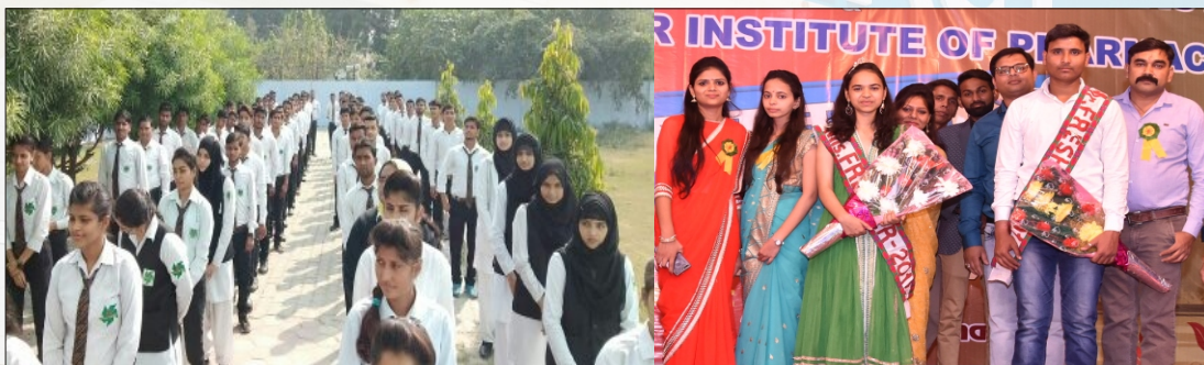
Pared time of Pharmacy students

Hostel facility is available separately for boys and girls. The rooms are well furnished and ventilated, having water cooler & geyser facility. Round the clock light, water & security is provided.