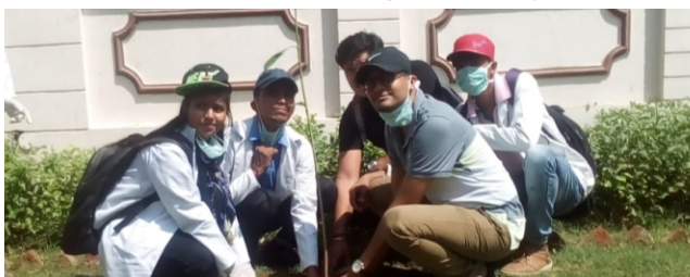
Planting Plants in the Plantation Program