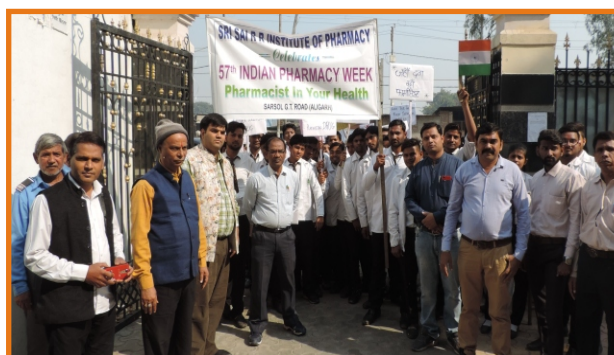
Indian Pharmacist Day Celebration

Eligibility : 10+2 (PCB/PCM) with 50% marks