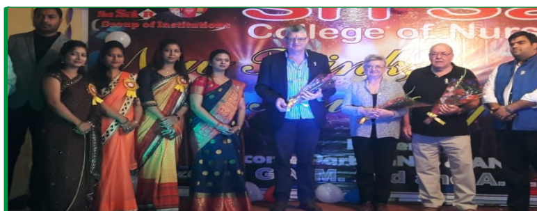
Welcoming Foreign visitors in Nursing College