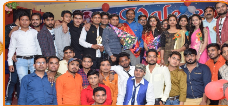
Celebration on Farewell Party of D.Pharma Students