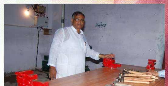
Reflecting Institute Plumber laboratories during SCVT inspection